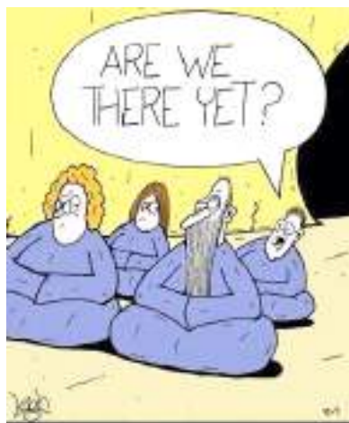
On the family trip to nirvana